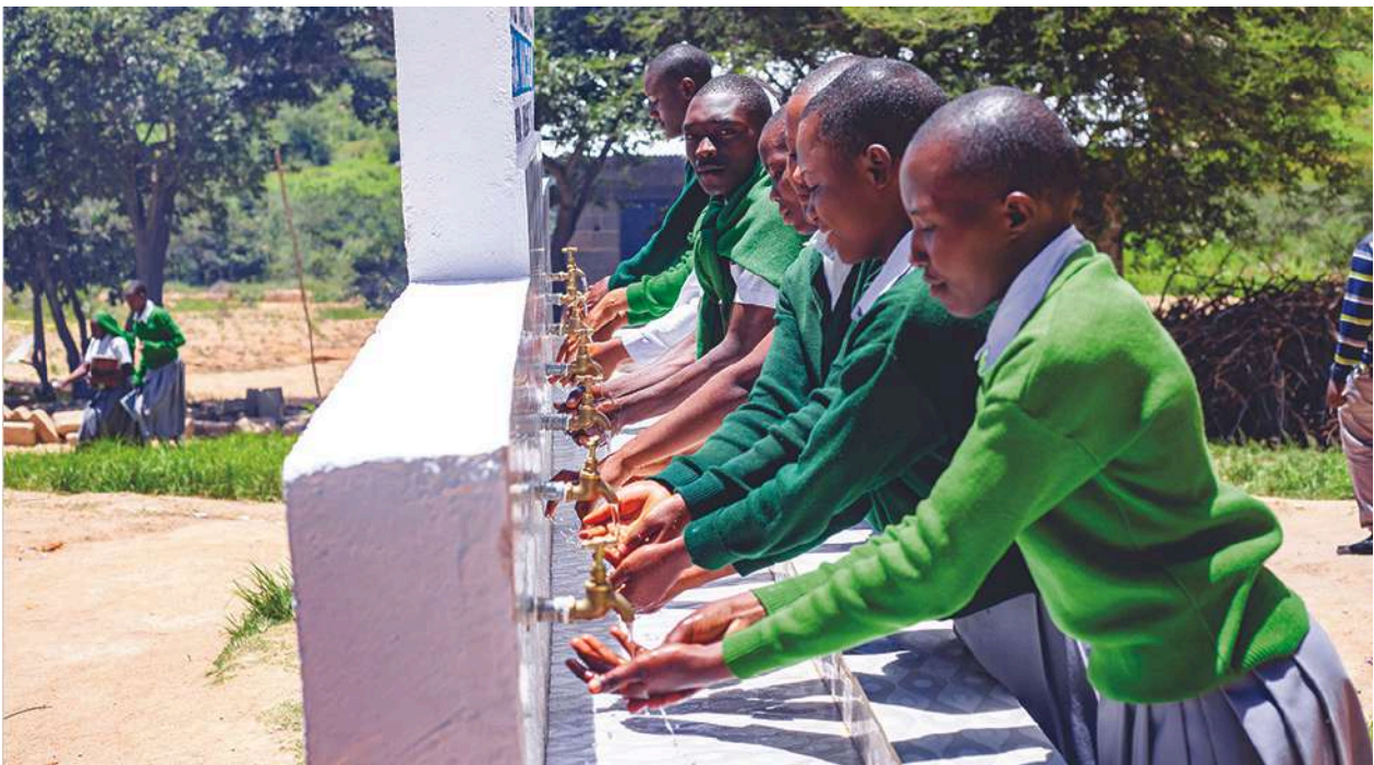
Students of Mazombe Secondary School in Kilolo District Council practicing proper hand washing procedures during the hand washing hygiene session.

The Afyaplus Organization has continued to advance its development agenda in the prevention and control of water, sanitation, and hygiene (WASH) related diseases. This has been accomplished by implementing the Safe Pad Lab and Water in Schools initiatives. The organization focuses on encouraging the building of WASH facilities in schools, providing WASH training to stimulate behavior change, and motivating and persuading decision-makers, other WASH stakeholders, and the general public to support its initiatives. The major goal is to improve WASH services in schools and communities, which will result in long-term strength and comfort.