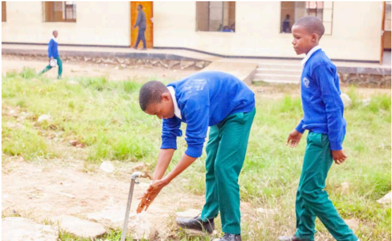
Hand washing facility in Kleruu Secondary before the construction of new hand washing station

At Klerruu Secondary School: Kleruu Secondary School is a school located in Iringa Municipal Council, the water infrastructure is puny, as they have one water tape station for 890 students and their teachers. This water is not sufficient and cannot support all the students as well as the teachers