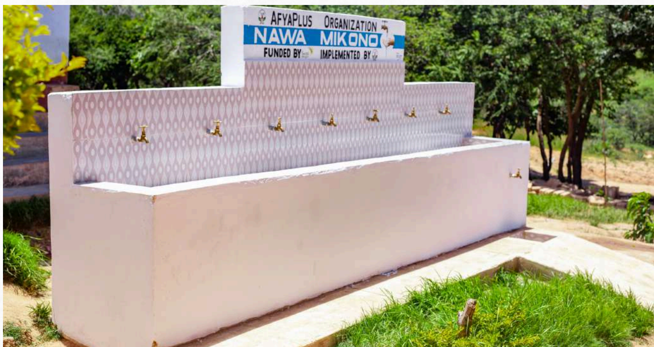
The newly completed handwashing facility at Mazombe Secondary School, in Kilolo District Council. The facility has eight taps, allowing multiple students to wash their hands simultaneously.

Station has 8 taps, allowing multiple students to wash their hands simultaneously and saving time during handwashing activities. With the addition of these three handwashing stations, a total of 38 schools have been reached by the Water in School project in the Iringa region.