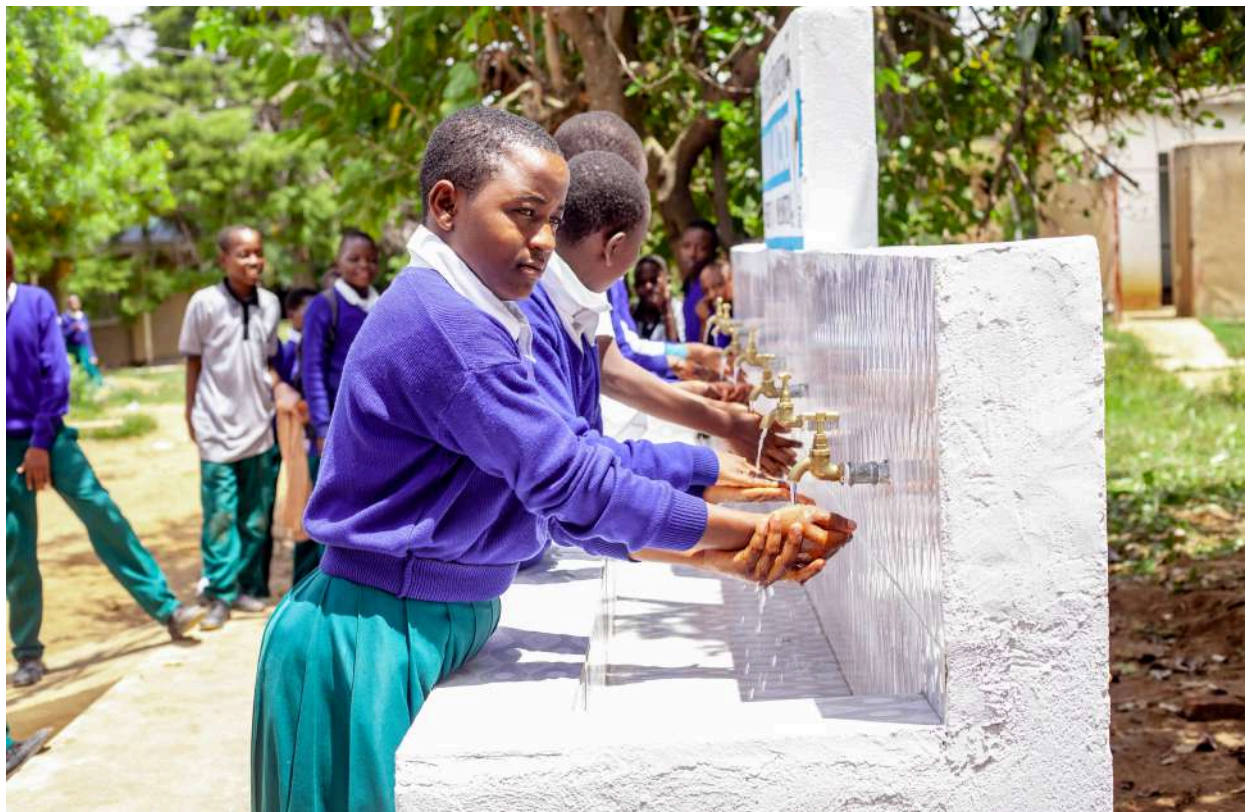
Students of Kleruu Secondary School in Iringa MC are washing their hands in a hand washing station built by Afyaplus Organization this quarter

The Afyaplus organization in energies to realize sustainable development goals number 4 and 6, implements a project that is inclusive for school children and profits more than 10000 school children, teachers, and other school workers in the Iringa region. School girls, children, and youth face several challenges related to Water, Sanitation, and Hygiene (WASH) and livelihood interventions. These challenges can significantly impact their health, education, and overall well-being.