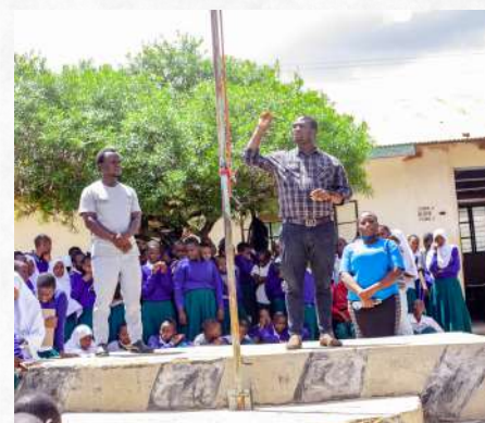
Gangilonga ward Education Officer, Afyaplus Project Officer and Iringa Municipal Health Officer conducting hand washing hygiene sessions in schools community of Saba saba Primary, Mazombe Secondary and Kleruu school including teachers, students and other school workers respectively