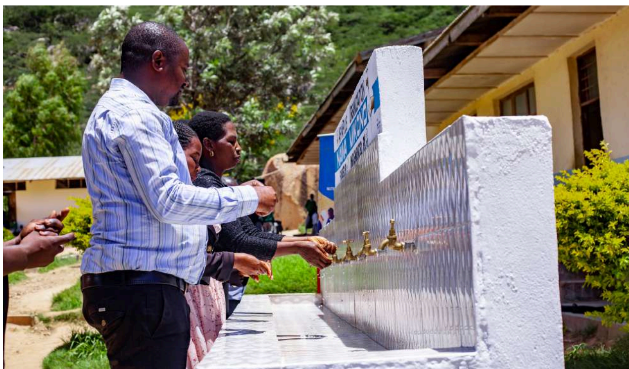
The School teachers and staff at Mazombe Secondary School in Kilolo District Council diligently washed their hands after attending a hand hygiene session conducted in March 2024.

To address the aforementioned challenges, the Afyaplus organization implemented this project purposely to protect students from WASH-related diseases. The project focuses on improving access to water, sanitation, and hygiene services in schools by constructing hand-washing facilities in Iringa schools and conducting awareness-raising sessions on good sanitation and hygiene practices.