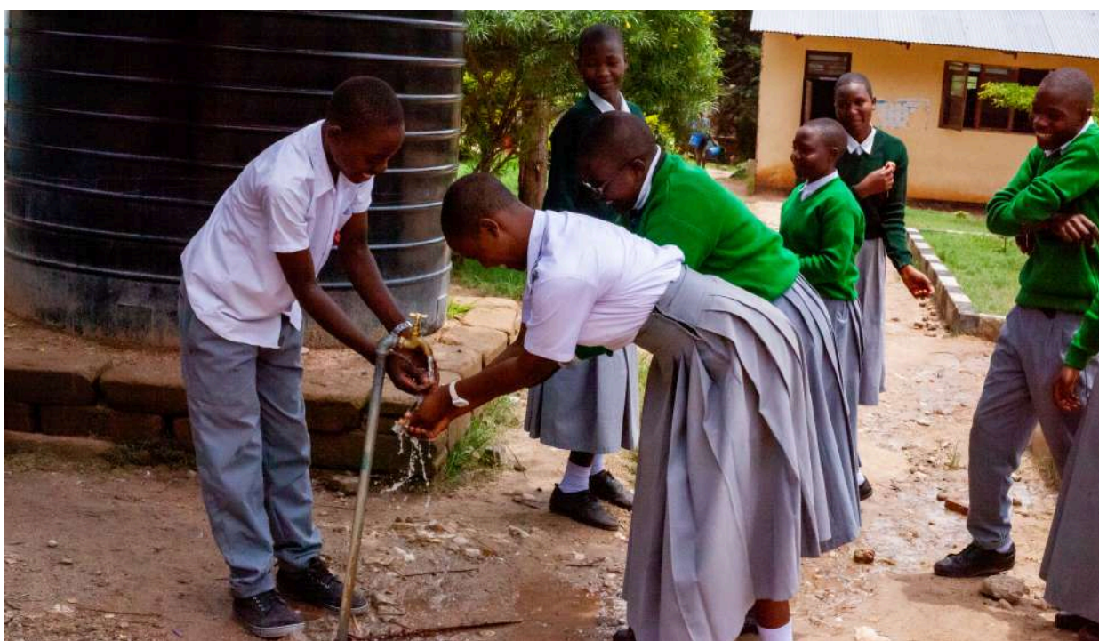
Students at Mazombe Secondary School in Kilolo District Council are washing their hands on the single tap connected to a Simtank this tap serves a total of 853 students which cause some delays and queue.

At Sabasaba Primary School, the facility used for hand washing was one water tap which is directly connected to the IRUWASA water system, and at Mazombe Secondary School they use one water tap connected to a sim tank (Water storage), which makes students spend more time washing their hands and some could not wash their hands at all.