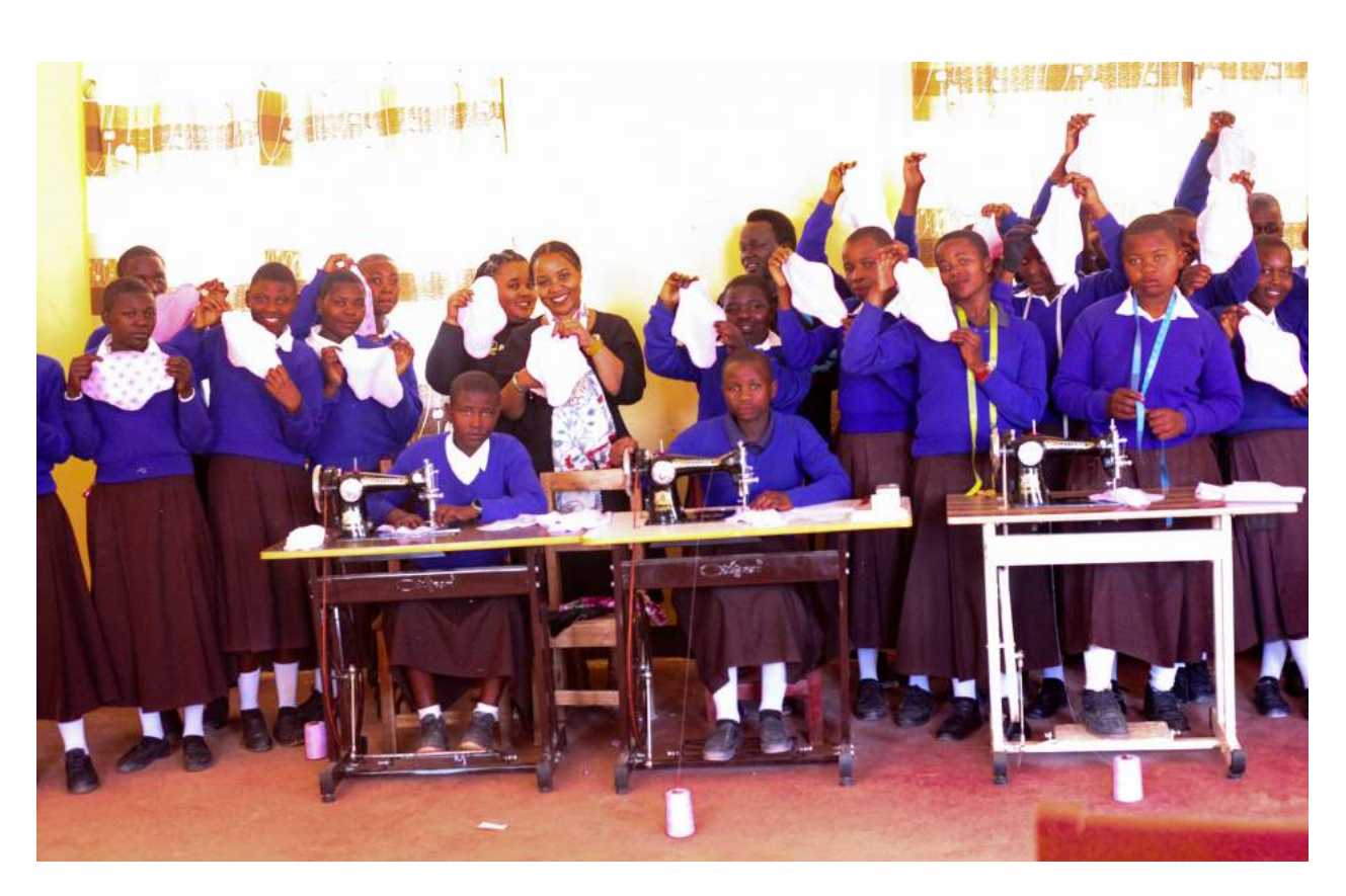
Follow us on social media pages.

Afyaplus team we are so grateful for the Segal family foundation visit and thank you for your valued partnership in helping us to grow and spread to communities. Your mission presence our energizes us to continue making a difference. anytime! Our story is Welcome back about prevention