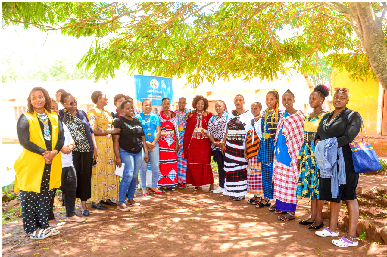
Fig 19: Afyaplus team, Malala country director, and other Malala grantees during their visit at Ismila secondary school of Iringa DC.