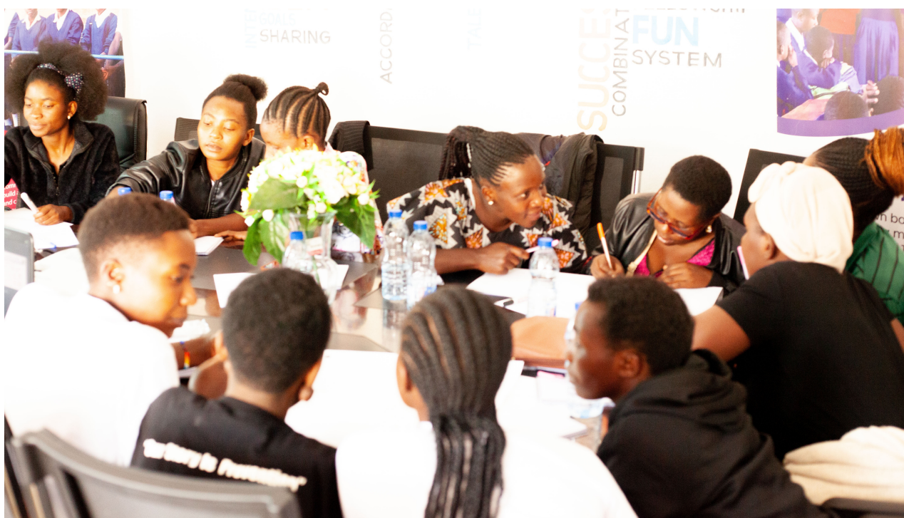
Fig 8: Community-based trainers from Afyaplus organization actively participating in an assignment related to good menstrual hygiene management (MHM) during training of trainers(ToT) training.

In the last quarter, Afyaplus recruited and trained 10 community volunteers, entitled Community-based trainers (CBTs) in order to strengthen the implementation of the Safe Pad lab project in the Iringa region. The goal of this training was to equip the CBTs with the necessary skills and knowledge needed to create awareness of Adolescent sexual reproductive health and rights (ASRH) and good menstrual hygiene management (MHM) among school girls and boys from all 50 schools covered by the project.