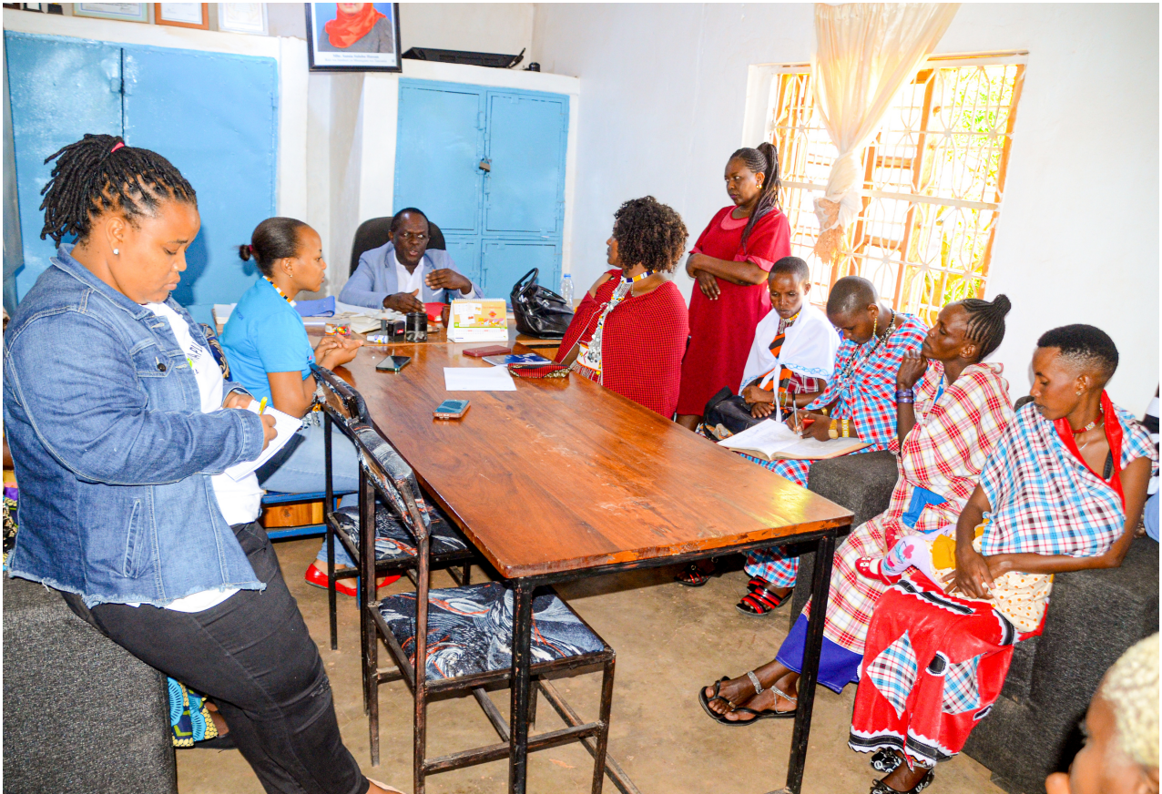
Fig 18: Afyaplus team and other Malala Fund grantees during the meeting with the headmaster of Isimila secondary school at Iringa DC.

However, the headmaster of Isimila secondary school of Iringa DC, shares how the project impacted the lives of students concerning their performance and retention to the Malala Fund Country Director, and other Malala grantees. It was found that student attendees and performance have increased because girls' confidence and dignity have been restored together with access to reusable sanitary pads at the school level.