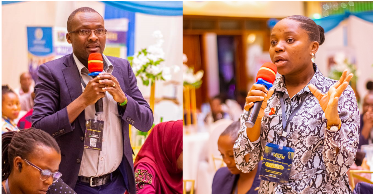
Fig 13: Participants of Afyaplus' third WASH Gala sharing experiences/challenges on the issue of affordability and accessibility of quality sanitary products.

Afyaplus organization really appreciates the panelist team, leaders from local government authorities, school management teams, representatives from NGOs, Companies, institutes, and other invitees for their valuable contribution to how we can improve Water Sanitation and hygiene (WASH) services in schools of Iringa.