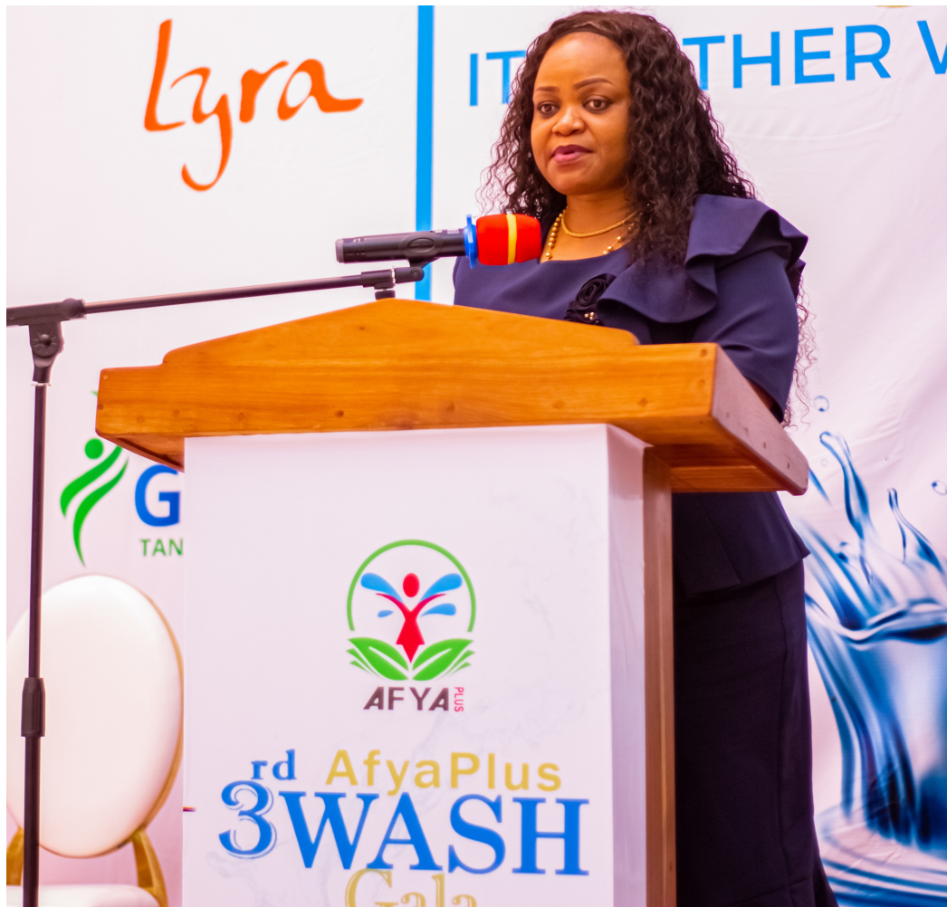
Fig 12: The guest of honor, the Deputy Minister for Water, Honorable Eng. Maryprisca Mahundi (MP) during her speech at Afyaplu's third WASH Gala.

The initiative aims to reduce the time spent fetching water and promote good health practices, ultimately leading to improved school attendance and performance. The event took place on March 24, 2023 at Masit Grand Hall and the guest of honor was the Deputy Ministry for Water, Honorable Eng. Maryprisca Mahundi (MP).