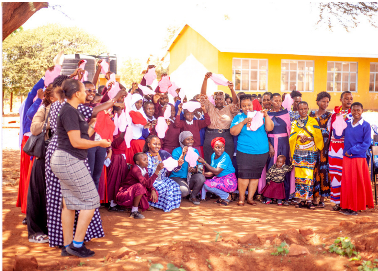
Fig 18: Afyaplus team, and other Malala grantees during their visit at Ismani secondary school of Iringa DC.