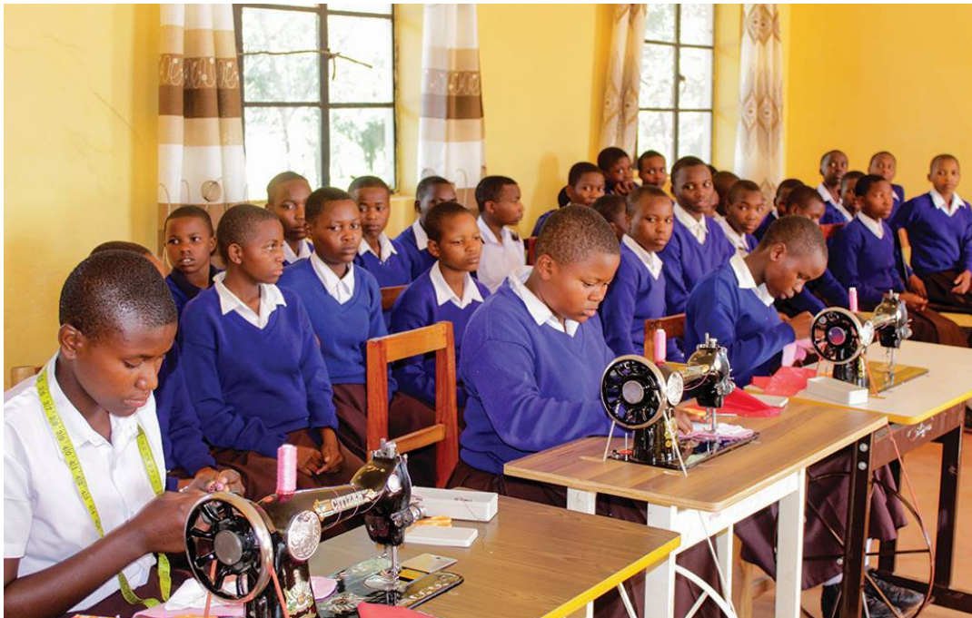
Fig 4: Sewing session of Reusable sanitary pads conducted to students of Lundamatwe secondary school of Kilolo DC.

As a mechanism to improve access to quality sanitary products 1154 students (138 boys and 1016 girls) from 12 schools were capacitated on how to sew reusable sanitary pads. Out of 1154 students reached a total of 232 students were Girls from Kilolo DC, 382 students ( boys 10 and girls 372) from Iringa Dc, 450 students (boys 114 and girls 336) from Iringa MC, and 90 students (boys 14 and girls 76 ) are from Mafinga Tc.