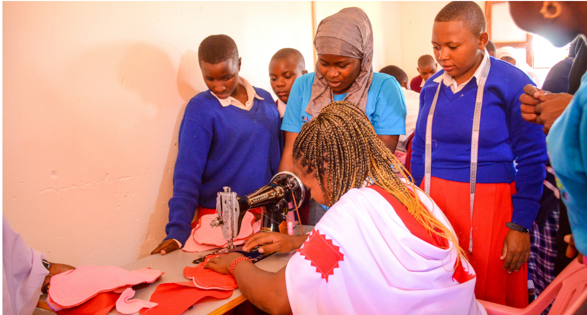
Fig 16: Beneficiary of other Malala Fund grantees learning how to sew reusable sanitary pads during her visit Ismani secondary school of Iringa DC

Other Malala Fund grantees and the Malala Fund Country Director visited the safe pad labs at Ismani and Isimila Secondary schools and learn how labs operate in schools and how they can use available resources in their areas to implement the same project and remove barriers girls face during menstruation both in school and out of school.