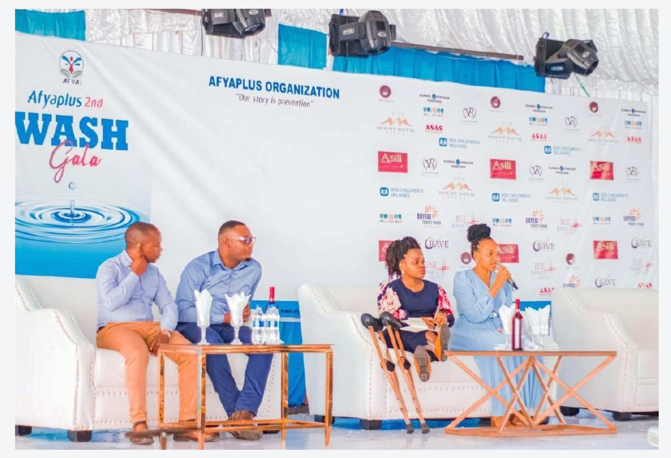
Fig 8: Panelist team sharing ideas on how to improve water services during Afyaplus 2nd WASH gala

Panelist discussion was conducted by the panelist team in collaboration with all the guests. The major aim of this discussion was to share experience and ideas towards sustainable solutions for improving WASH services in Iringa schools, reducing time spent fetching water increasing health standards, and ensuring a favorable environment that increases children's school attendance and performance.