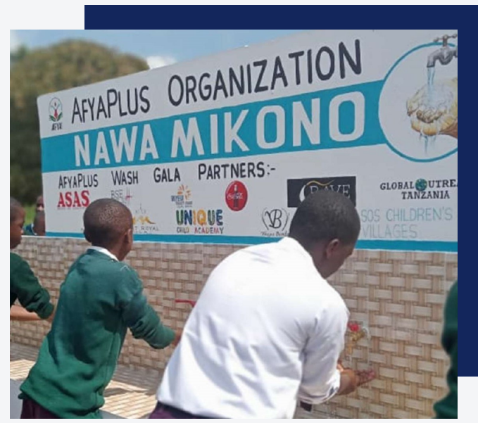
fig 4:Hand washing facility constructed at Mivinjeni sec by the Fund raised on Afyaplus WASH gala

During this year 2022, the organization managed to provide education on good sanitation and hygiene practices to students 5472 (1875 boys, and 3776 girls) from 6 schools whereby 2 schools were secondary schools namely Mivinjeni, and Lipuli and 4 schools were primary schools namely Igumbilo, Kibwabwa, Igingilanyi and Luhindo.