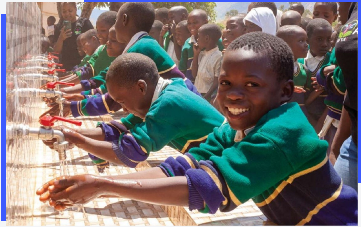
Figure 6: Hand washing facility constructed of lgingilanyi primary of Iringa MC.

The fund raised at Afyaplus 2nd WASH gala, helped the organization to construct 6 hand washing stations in 6 schools namely Mivinjeni secondary, Kibwabwa primary, Igumbilo primary, Lipuli secondary, Luhindo primary and Igingilanyi primary.