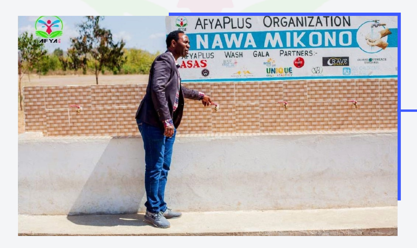
Fig 1. Afyaplus hand wash facility was constructed at Lipuli Sec of Iringa DC as a result of funds raised on

The major aim of the event was to collaborate with different stakeholders to come up with a sustainable solution for improving WASH services in Iringa and to raise enough funds for initiating 5 reusable sanitary pad laboratories and construct hand washing stands in 10 schools within the Iringa region whereby eight children can access and wash their hands at once. By so doing it will help to reduce time spent fetching water thus increasing health standards by ensuring a favorable environment that increases children's school attendance and performance. The event was conducted at Royal Palm Hall and was attended by the Iringa District Commissioner who was the guest of honor.